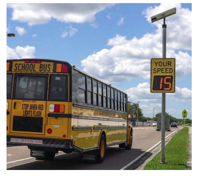
Radar speed feedback sign installed on same post as Speed Limit sign